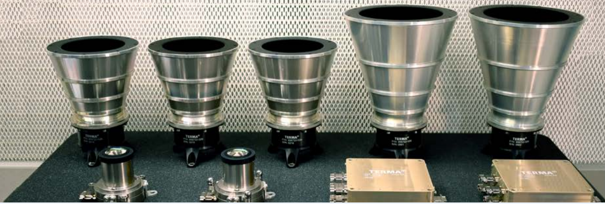
T1 Star Tracker